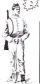
The three picture riddles represent pesukim , mitzvot or personalities from the parsha .